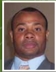
8. London Burnett Cleveland, OH